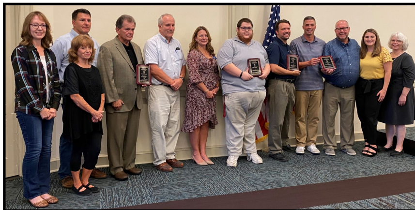
2020 Community Improvement Awards Presented September 16, 2021