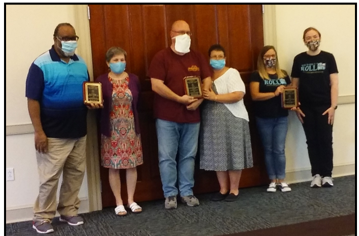
2019 Community Improvement Awards Presented August 20, 2020